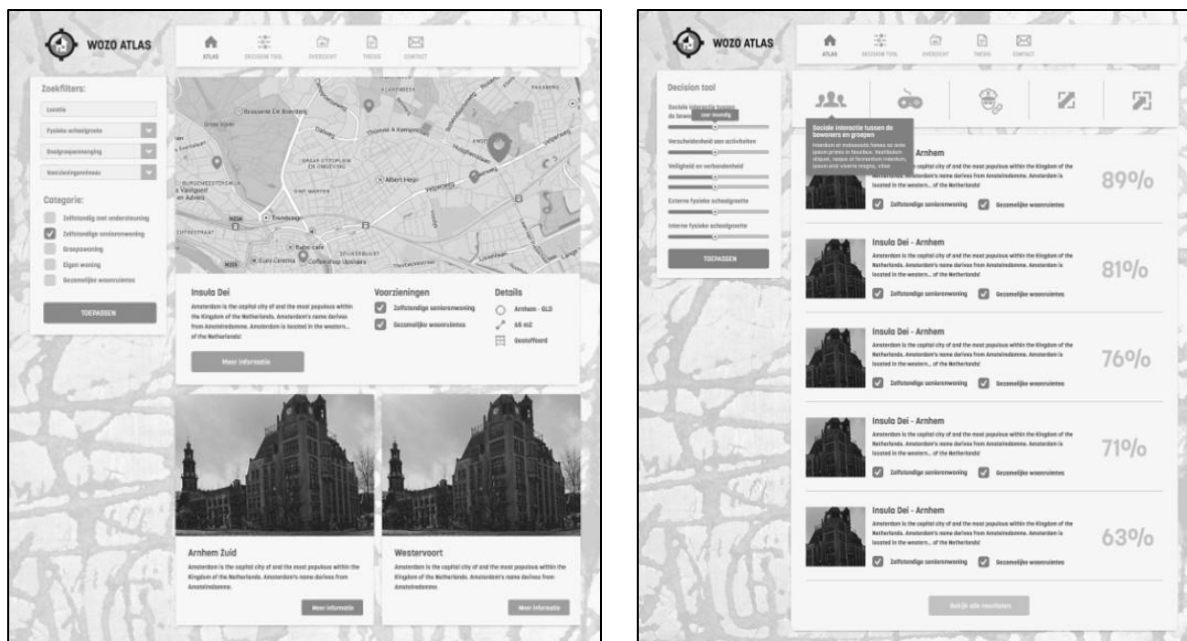
Figure 3 Impression Online Sheltered Independent Living Atlas

The online Sheltered Independent Living Atlas, see Figure 3, is meant as a digital reference and decision-making tool. The idea behind the digital version is that it can be used as a reference book of collected evidence based information or as step by step decision making tool. In that case, global choices for one of the variables for example physical scale are indicated, and minima, maxima, and optima suggestions for the other variables are presented. This can lead to specific recommendations illustrated by narratives, and for matching examples from the case study illustrated with data and illustrative material.